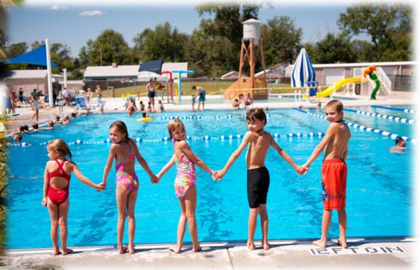
Or to a local pool, park, or trail!