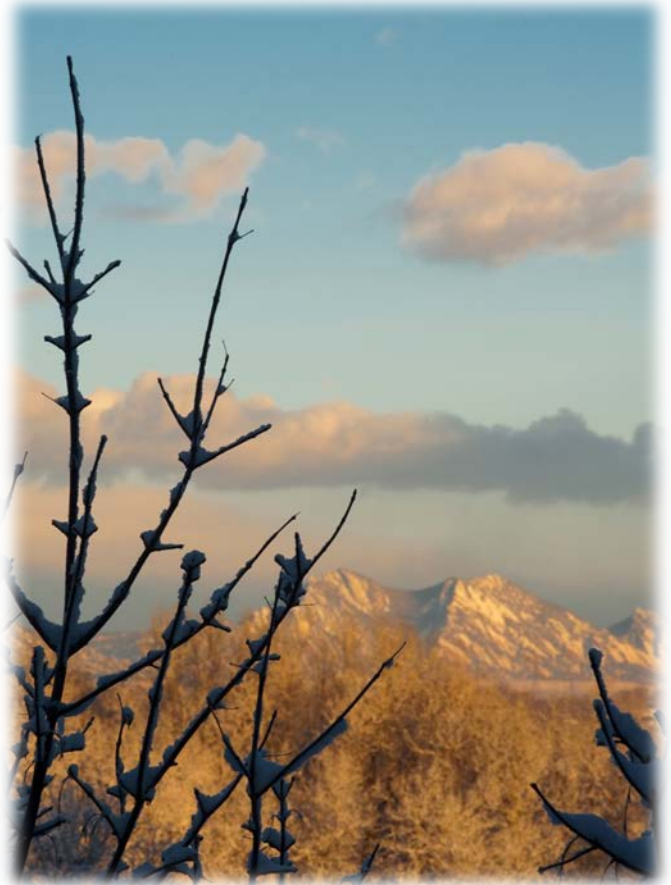
To the Rocky Mountains...