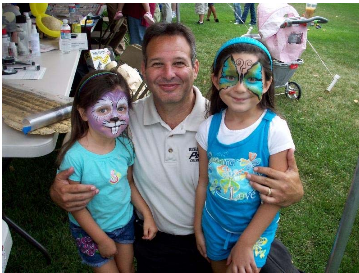
Citizens of all ages joined the Wheat Ridge Police Department in celebrating National Night Out on August 4th!