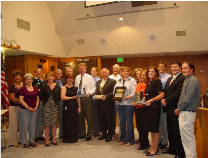
The 2008 Business Award Winners!