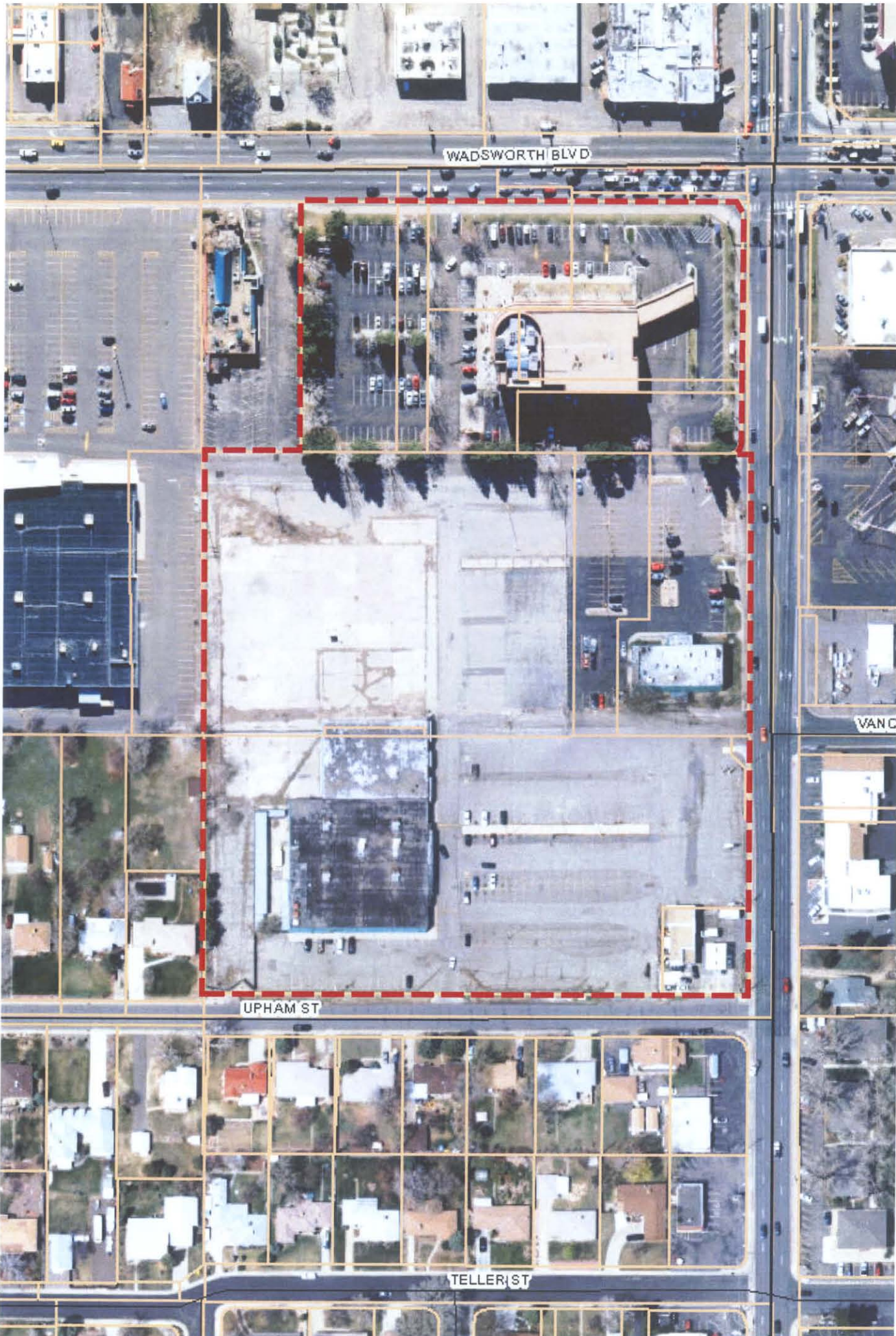
EXHIBIT A: Proposed Rezoning Area for Southeast Corner of Wadsworth and W. 44th Ave